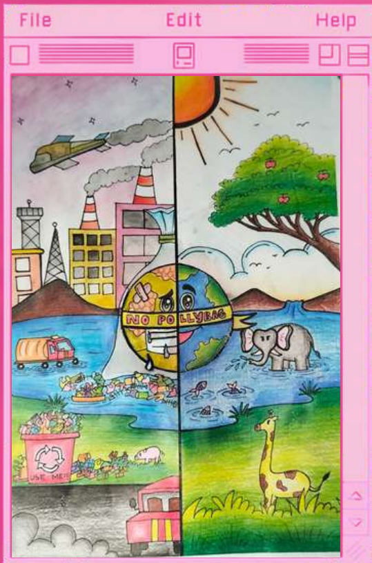
Debarrita Parida VII - Crayon