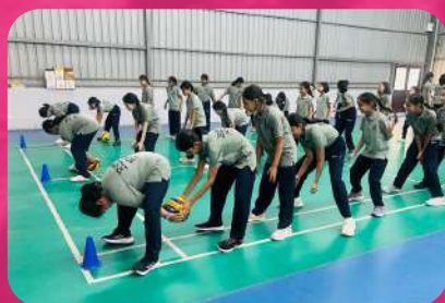
New Students Fun Games Session