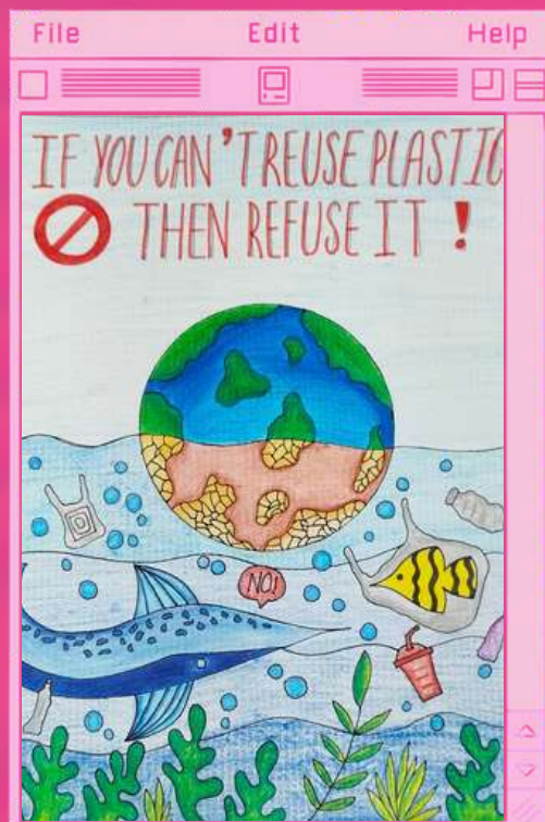
Vadaanya Agarwal VIII - Crayon