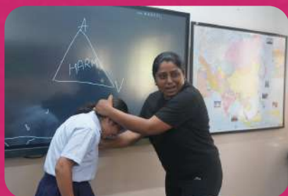
Self Defence Workshop