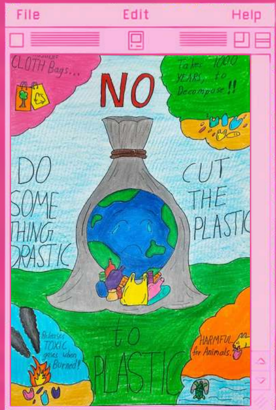
Aanya Agrawal VII - Crayon