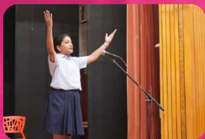
I/H Kavya Path