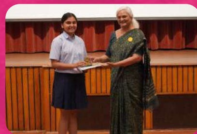
Academic Excellence Awards