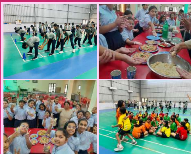
Induction Activities for New Students