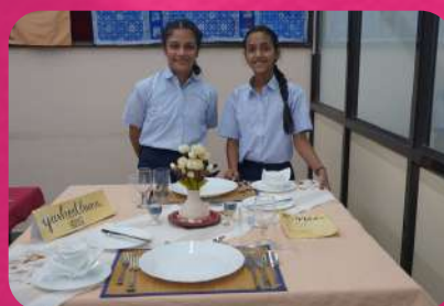
I/H Table Setting