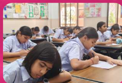
I/H English & Hindi Article Writing