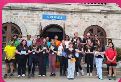
UK Exchange Programme