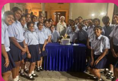
Achievers' Dinner at Principal's Residence